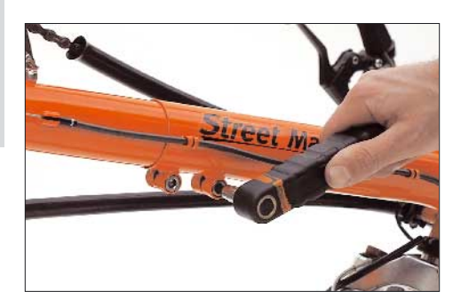
Unscrew the clamping screw to adjust the front boom.

When you pull out the front boom shift the chain on the smallest chain ring and sprocket and turn the cranks a little bit backwards while pulling. Thus the chain is not under tension.